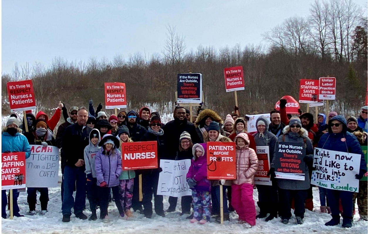
ACMH Nurses United Strike, Kittanning, PA, March 12, 2022